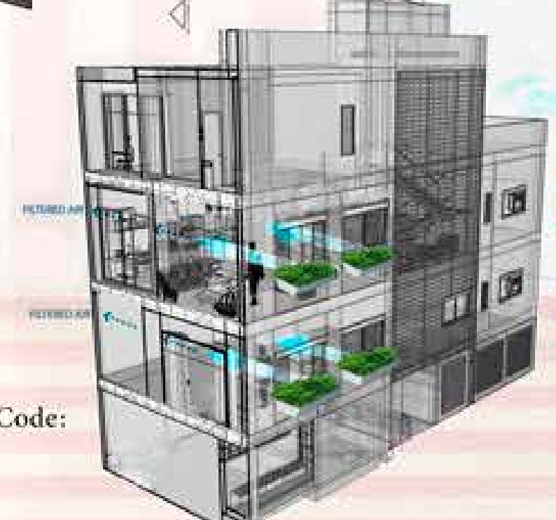
Green Vegetation on the Facade Providing Air Filtration