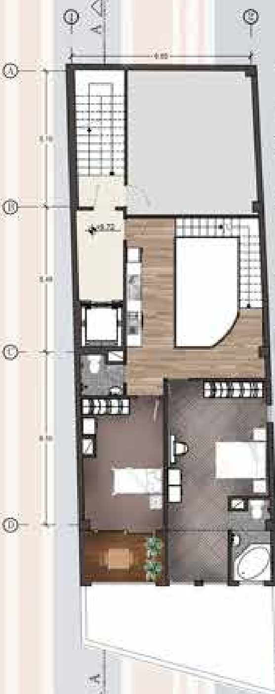
Third Floor Plan SCALE: 1/100