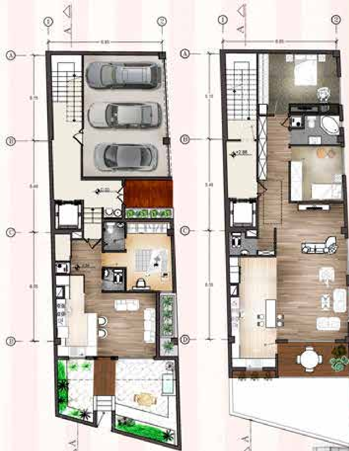
Ground Floor Plan SCALE: 1:100